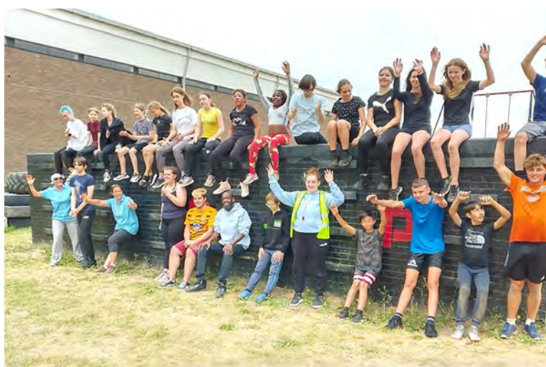
HAF Summer assault course

Thanks to Waterbeach Parish Council, some very generous local supporters and a number of other pots of funding, we are able to provide our youth club free of charge which means that financial circumstances are not a barrier for young people to attend.