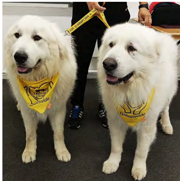
Visit by Therapy Dogs Nationwide charity

Waterbeach Guides have been learning essential map-reading and travel skills, taking a trip into Cambridge on the train and navigating their way to a landmark and back to the station; making Beeswax wraps and finding out more about endorphins and looking after their mental wellbeing. 1st Waterbeach Brownies have been on an autumnal 'Bat Walk' at the Botanic Gardens; enjoyed a visit from some Therapy dogs, made compasses from paper clips and created pointillism works of art. Meanwhile, Rainbows have been busy practising their First Aid skills, making clay candle holders for Diwali and learning how to plait.