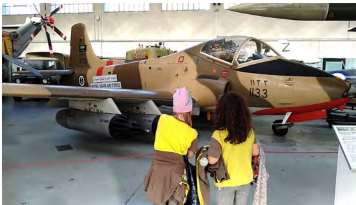
'Sleeping under the Wings' event for Brownies at IWM Duxford

More than 500 Brownies and 100 leaders from Girlguiding Cambridgeshire East spent the night 'sleeping under the wings'. They set up camp under Concorde, Hastings, Vulcan, Avro York Lightning and TSR2 Aircraft for the night. After learning some fascinating facts about Concorde, the Berlin