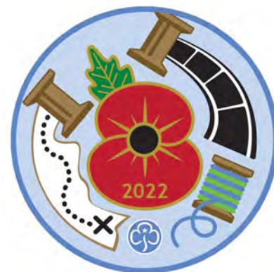
Girlguiding Cotton Reel Remembrance Challenge

All of our units joined with the village community for the annual Remembrance service at the war memorial. Much preparation occurred in the run up to the parade; 2 nd Waterbeach Brownies polished the brass in St John's Church, many creative poppies and memorial wreaths were made. As we came together we also remembered our patron of Girlguiding, Her Majesty Queen Elizabeth II.